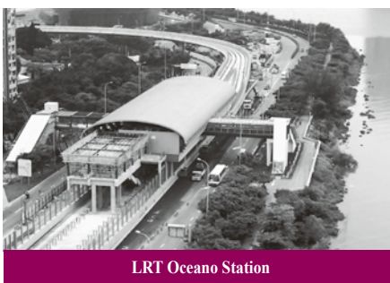
LRT Oceano Station