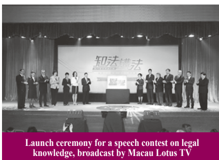
Launch ceremony for a speech contest on legal knowledge, broadcast by Macau Lotus TV