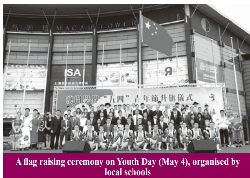
A flag raising ceremony on Youth Day (May 4), organised by local schools