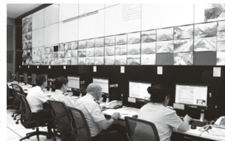
The Civil Protection Action Centre strives to fulfil preventive and emergency rescue duties