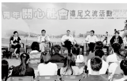
The Chief Executive exchanges views with young people