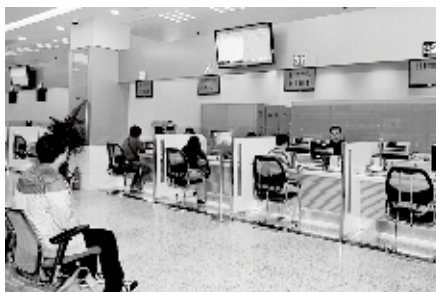
Enhance the Government Integrated Service Centre's functions to provide quality public services