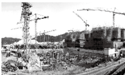
Public Housing Project in Seac Pai Van, Coloane