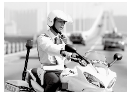
Serving the people with integrity