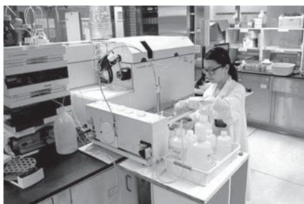
The IACM Laboratory is fully committed to food safety