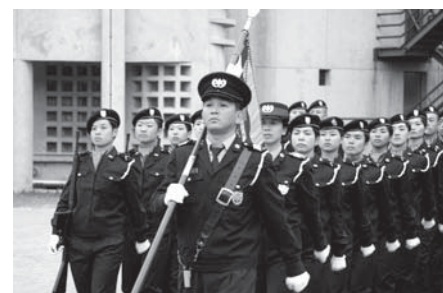
The PSPF pursue the goals of integrity, high efficiency, competence and professionalism