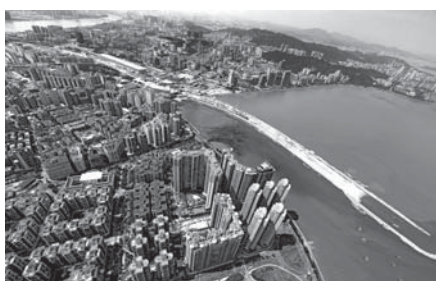
Expedite regional cooperation and cross-border infrastructure construction