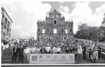
A mega delegation for "Experience Macau Tour" visits Macao