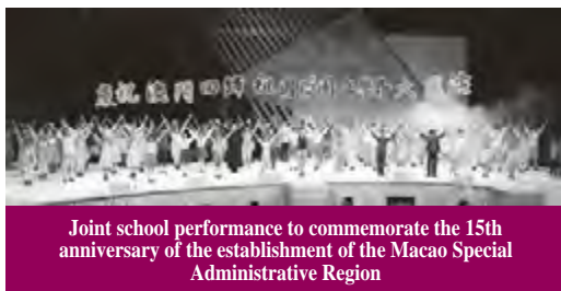
Joint school performance to commemorate the 15th anniversary of the establishment of the Macao Special Administrative Region