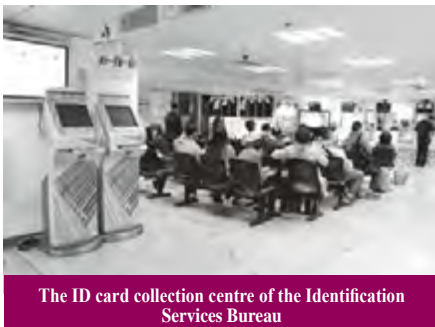
The ID card collection centre of the Identification Services Bureau