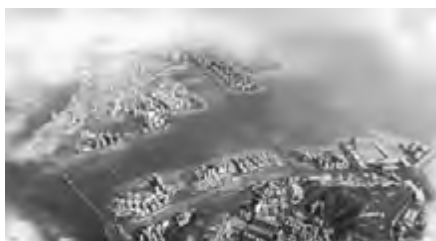
Optimising urban development planning to create a quality living environment