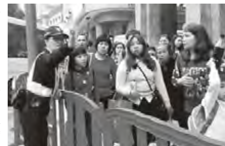
Through detailed planning and provision of clear instructions, the police effectively maintain good order of Macao’s tourist spots

Continue to help and support inmates with social rehabilitation, through professional counselling services provided by social workers, seminars and workshops, vocational training courses and other public activities.