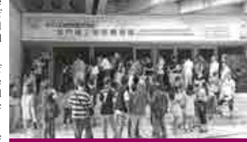
Citizens vote in an orderly manner during the 6th Legislative Assembly Election