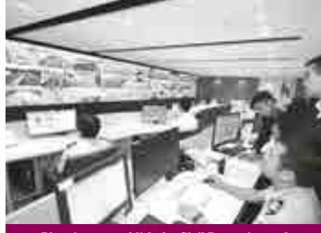
Planning to establish the Civil Protection and Emergency Coordination Bureau, and encouraging all communities to jointly prevent and overcome disasters