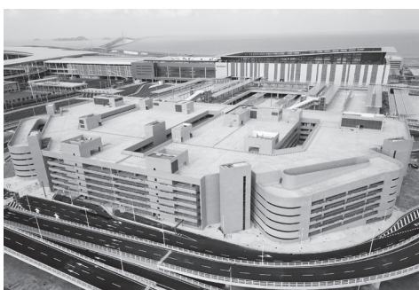
The Macao border crossing area of Hong Kong-Zhuhai-Macao Bridge