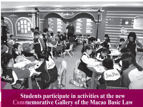
Students participate in activities at the new Commemorative Gallery of the Macao Basic Law