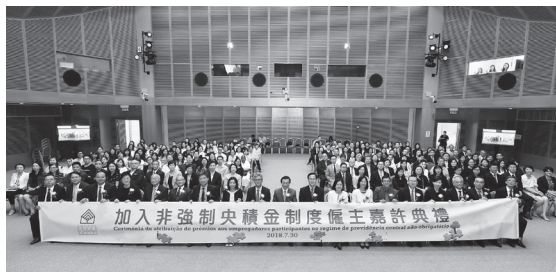
At a recognition ceremony held by the Social Security Fund on 30 July, 78 employers are commended for pioneering the adoption of the Non-Mandatory Central Provident Fund System to enhance retirement benefits for their employees.