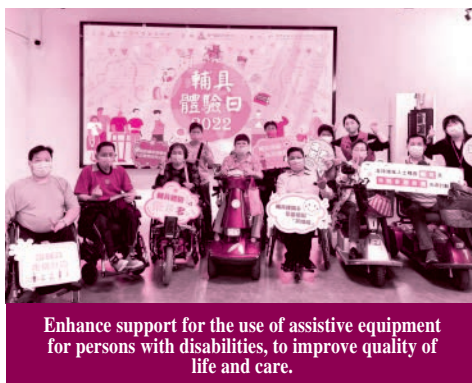
Enhance support for the use of assistive equipment for persons with disabilities, to improve quality of life and care.