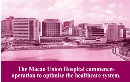
The Macao Union Hospital commences operation to optimise the healthcare system.