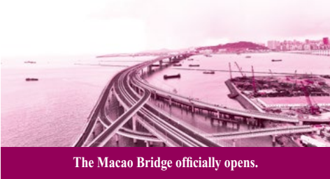
The Macao Bridge officially opens.