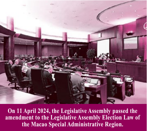
On 11 April 2024, the Legislative Assembly passed the amendment to the Legislative Assembly Election Law of the Macao Special Administrative Region.