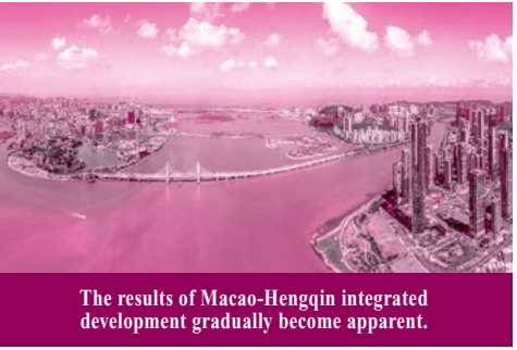
The results of Macao-Hengqin integrated development gradually become apparent.